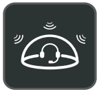
Acoustic Shield Technology

The Yealink WH62 is a new entry-level DECT wireless headset, with WH62 Dual and WH62 Mono two models. Work seamlessly with major UC platforms and integrate natively with Yealink IP phones. For crystal sound experience, Yealink Super Wideband Technology and Acoustic Shield Technology make you talk and hear clearly during phone calls and video conferencing. With easily on-ear control, interruption free, comfortable wearing, WH62 is a nice partner either for communicating or collaborating.